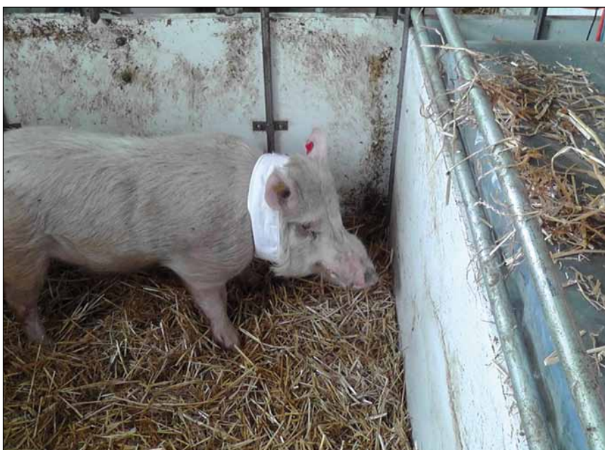
Fig. 1. The positioning of the collar for activity measurement in TgHD boar.

Moreover if the measurement was not running, minipigs still wore the empty collars. It eliminates the collar influence on their behavior. Minipig boars wore a collar with